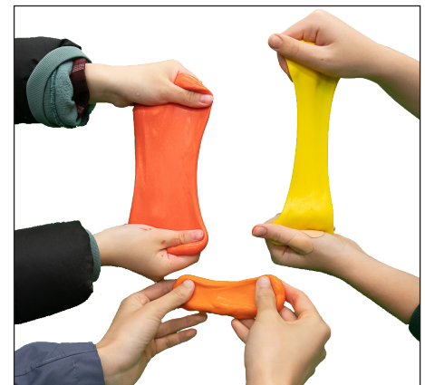
6. Stretch and check for consistency. If sticky, add 3/4 tsp contact lens solution.