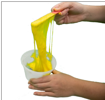
5. Take the slime out of the cup and knead it with both hands.