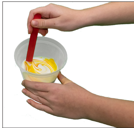
2. Add your choice of food coloring and mix with a popsicle stick.