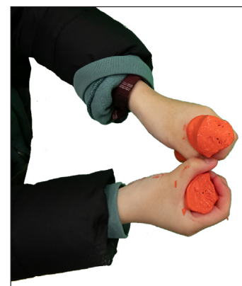
Test your slime's response to “shear force.”