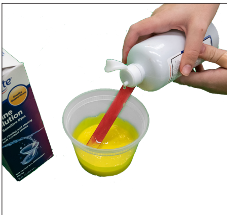
4. Add contact lens solution and mix until the slime gets harder to mix.