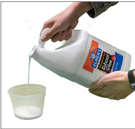
1. Pour the glue into your cup or bowl.