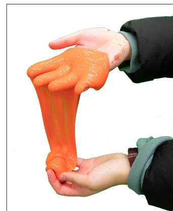
Test and change the viscosity of your slime.