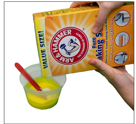
3. Add the baking soda and mix again.